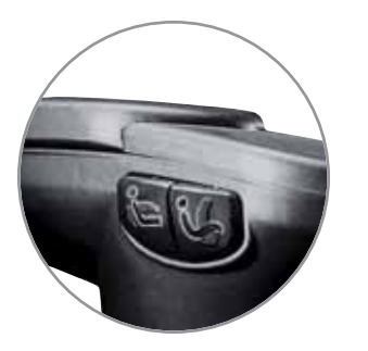
Most Adjustments are made while seated by activating button controls built into the armrests.